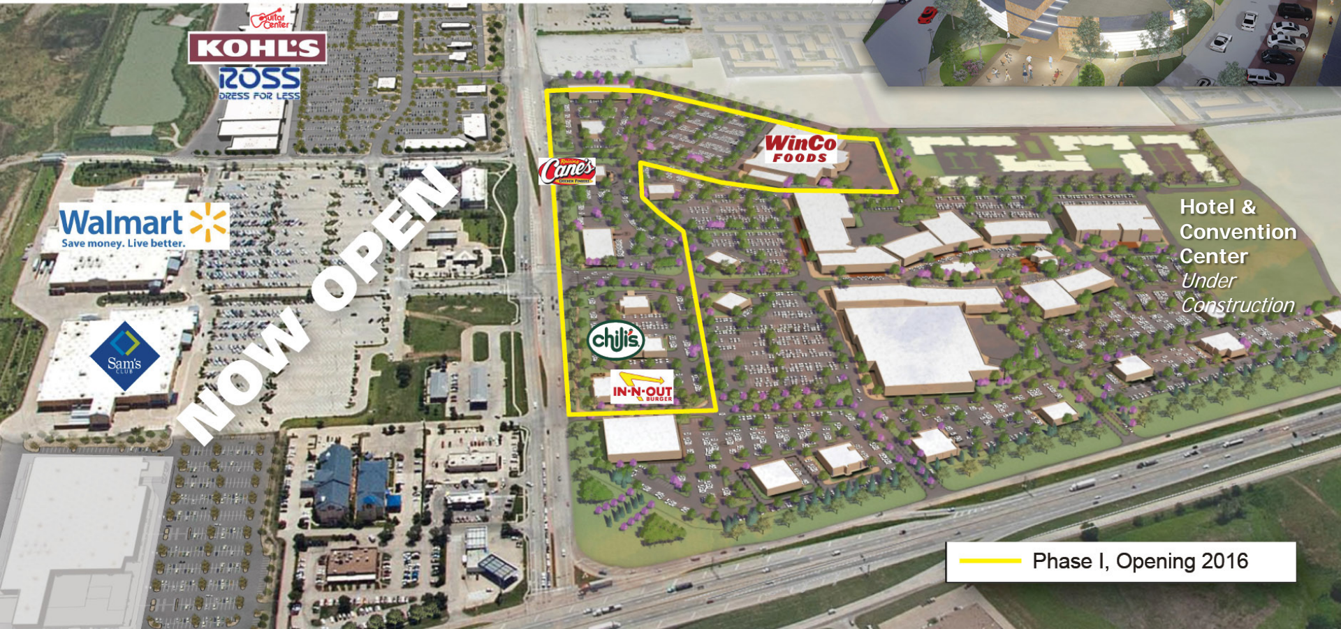
Phase I, Opening 2016